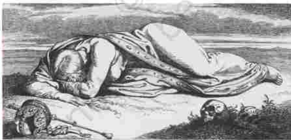
Fig. 18 — The fallen Germania, Julius Hübner, 1850.