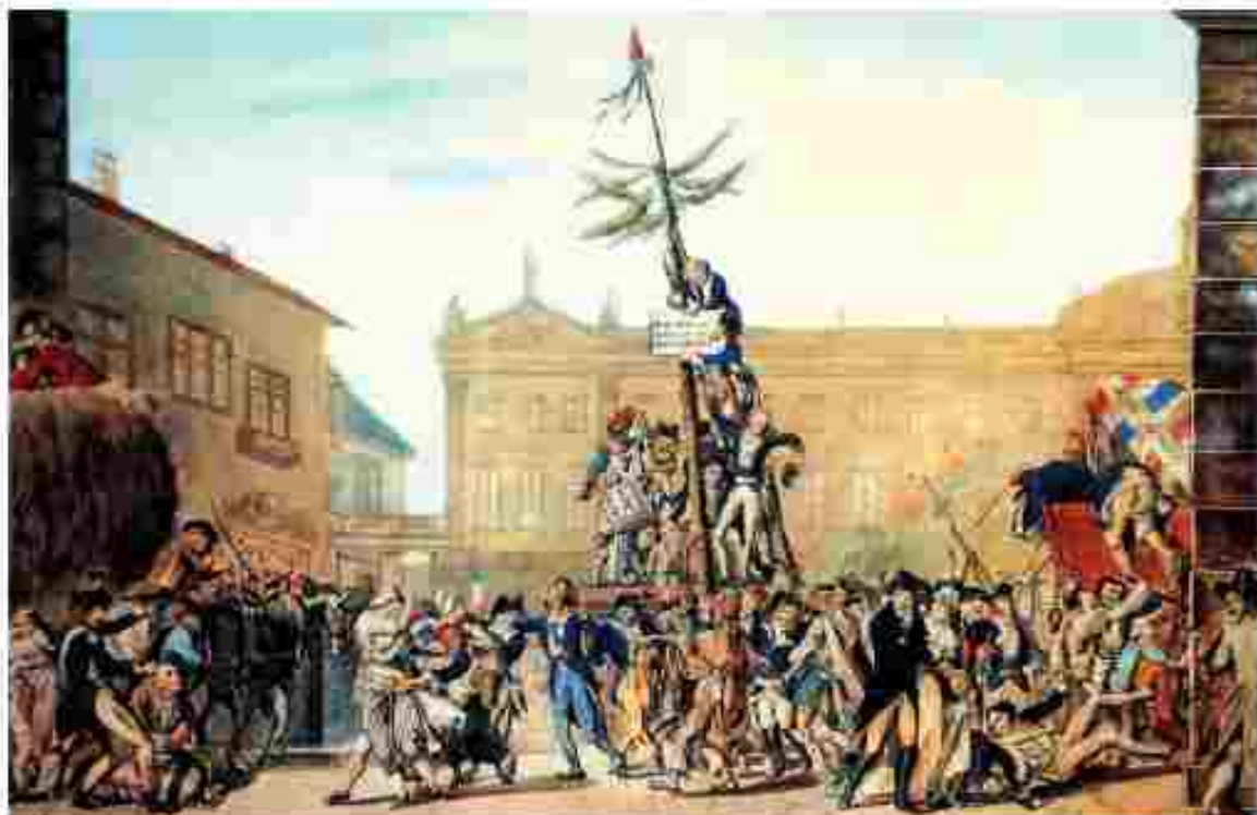
Fig. 4 — The Planting of Tree of Liberty in Zweibrücken, Germany

The subject of this colour print by the German painter Karl Kaspar Fritz is the occupation of the town of Zweibrücken by the French armies. French soldiers, recognisable by their blue, white and red uniforms, have been portrayed as oppressors as they seize a peasant's cart (left), harass some young women (centre foreground) and force a peasant down to his knees. The plaque being affixed to the Tree of Liberty carries a German inscription which in translation reads: 'Take freedom and equality from us, the model of humanity.' This is a sarcastic reference to the claim of the French as being liberators who opposed monarchy in the territories they entered.