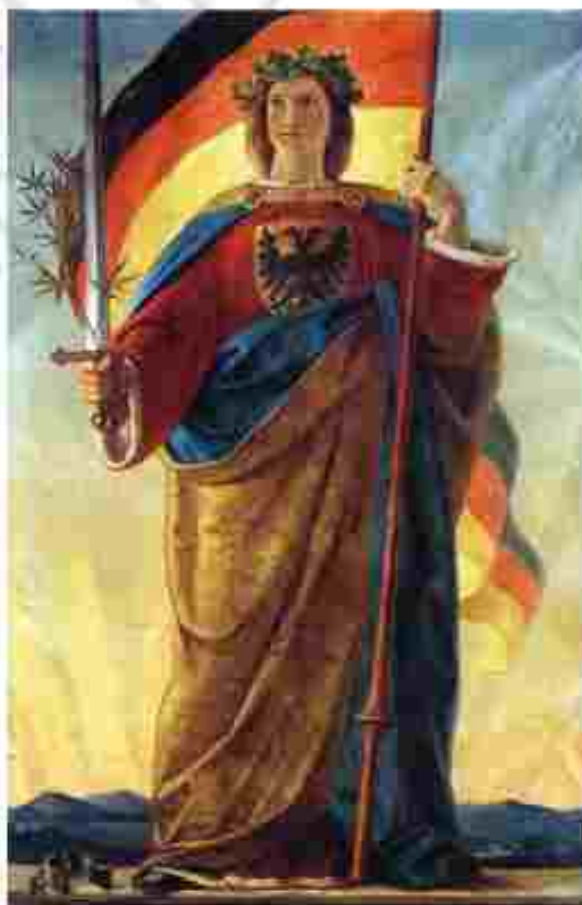
Fig. 17 – Germania, Philip Veit, 1848. The artist prepared this painting of Germania on a cotton banner, as it was meant to hang from the ceiling of the Church of St Paul where the Frankfurt parliament was convened in March 1848.