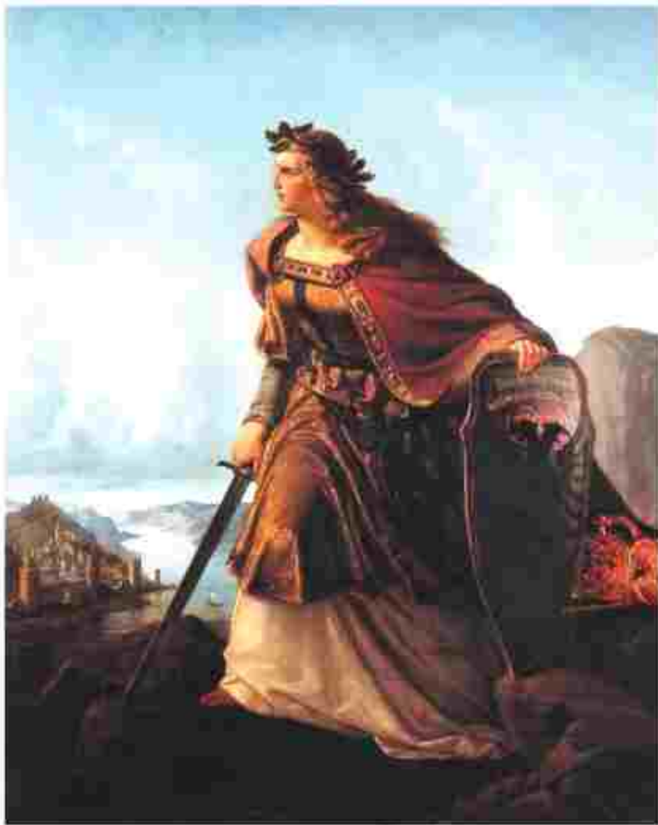
Fig. 19 – Germania guarding the Rhine

In 1860, the artist Lorenz Clasen was commissioned to paint this image. The inscription on Germania's sword reads: "The German sword protects the German Rhine."