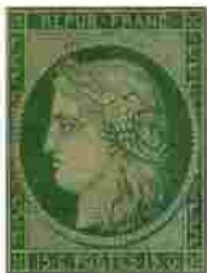
Fig. 16 – Postage stamps of 1850 with the figure of Marianne representing the Republic of France.

Allegory – When an abstract idea (for instance, greed, envy, freedom, liberty) is expressed through a person or a thing. An allegorical story has two meanings, one literal and one symbolic.