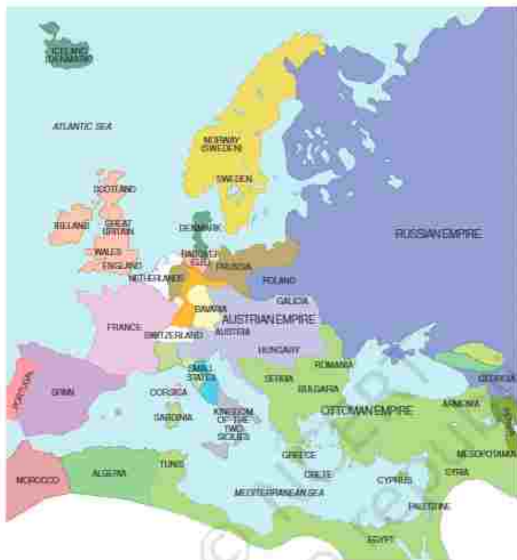
Fig. 3 – Europe after the Congress of Vienna, 1815.

Within the wide swathe of territory that came under his control, Napoleon set about introducing many of the reforms that he had already introduced in France. Through a return to monarchy Napoleon had, no doubt, destroyed democracy in France, but in the administrative field he had incorporated revolutionary principles in order to make the whole system more rational and efficient. The Civil Code of 1804 – usually known as the Napoleonic Code – did away with all privileges based on birth, established equality before the law and secured the right to property. This Code was exported to the regions under French control. In the Dutch Republic, in Switzerland, in Italy and Germany, Napoleon simplified administrative divisions, abolished the feudal system and freed peasants from serfdom and manorial dues. In the towns too, guild restrictions were removed. Transport and communication systems were improved. Peasants, artisans, workers and new businessmen