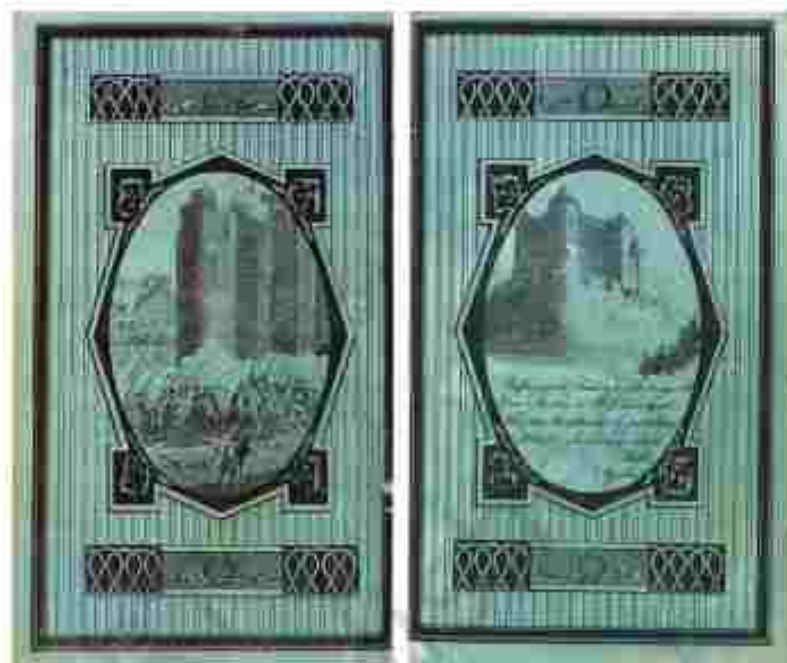
Fig. 2 – The cover of a German almanac designed by the journalist Andreas Rebmann in 1798.

When the news of the events in France reached the different cities of Europe, students and other members of educated middle classes began setting up Jacobin clubs. Their activities and campaigns prepared the way for the French armies which moved into Holland, Belgium, Switzerland and much of Italy in the 1790s. With the outbreak of the revolutionary wars, the French armies began to carry the idea of nationalism abroad.