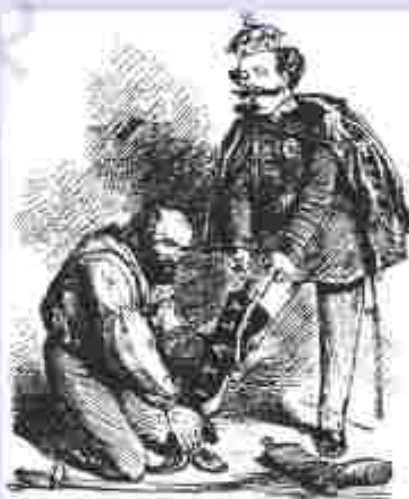
Fig. 15 – Garibaldi helping King Victor Emmanuel II of Sardinia-Piedmont to pull on the boot named 'Italy'. English caricature of 1859.

In 1867, Garibaldi led an army of volunteers to Rome to fight the last obstacle to the unification of Italy, the Papal States where a French garrison was stationed. The Red Shirts proved to be no match for the combined French and Papal troops. It was only in 1870 when, during the war with Prussia, France withdrew its troops from Rome that the Papal States were finally joined to Italy.