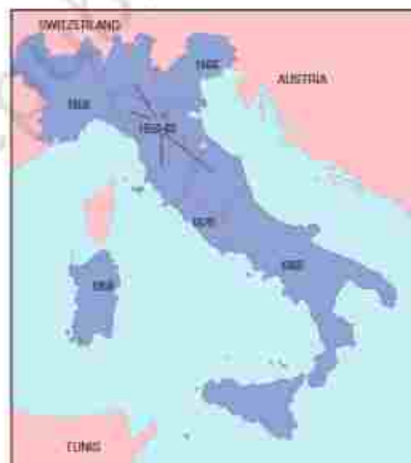
Fig. 14(b) — Italy after unification. The map shows the year in which different regions (seen in Fig. 14(a)) become part of a unified Italy.