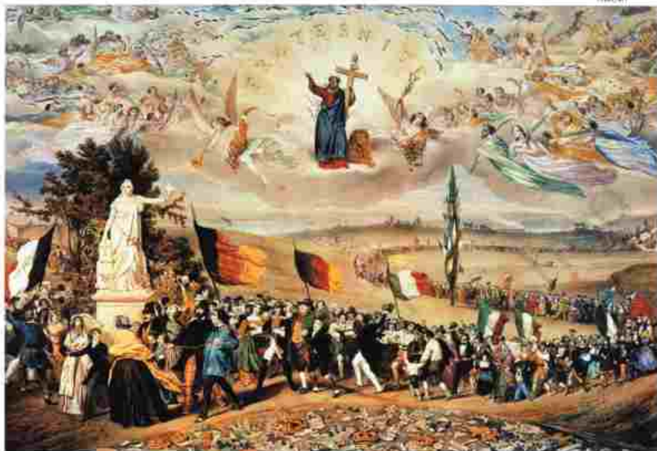
Fig. 1 – The Dream of Worldwide Democratic and Social Republics – The Pact Between Nations , a print prepared by Frédéric Sorrieu, 1849.

In 1848, Frédéric Sorrieu, a French artist, prepared a series of four prints visualising his dream of a world made up of 'democratic and social Republics', as he called them. The first print (Fig. 1) of the series, shows the peoples of Europe and America – men and women of all ages and social classes – marching in a long train, and offering homage to the statue of Liberty as they pass by it. As you would recall, artists of the time of the French Revolution personified Liberty as a female figure – here you can recognise the torch of Enlightenment she bears in one hand and the Charter of the Rights of Man in the other. On the earth in the foreground of the image lie the shattered remains of the symbols of absolutist institutions. In Sorrieu's utopian vision, the peoples of the world are grouped as distinct nations, identified through their flags and national costume. Leading the procession, way past the statue of Liberty, are the United States and Switzerland, which by this time were already nation-states. France,