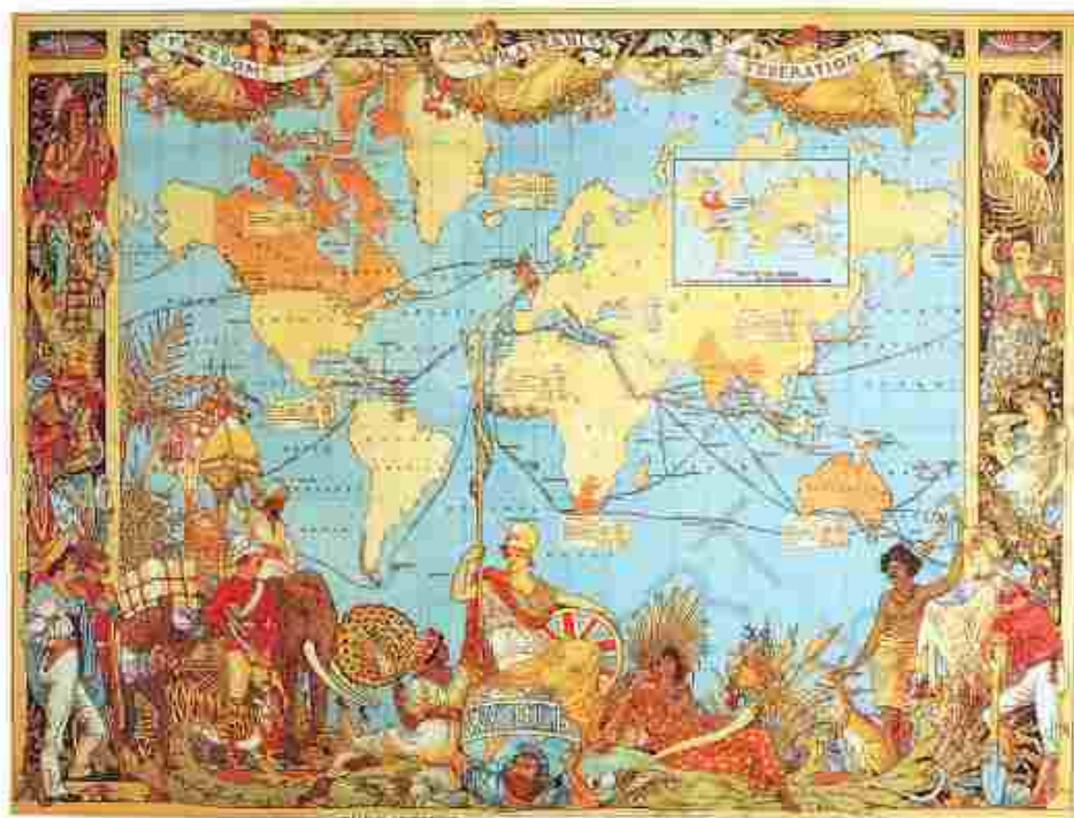
Fig. 20 — A map celebrating the British Empire.

At the top, angels are shown carrying the banner of freedom. In the foreground, Britannia — the symbol of the British nation — is triumphantly sitting over the globe. The colonies are represented through images of tigers, elephants, forests and primitive people. The domination of the world is shown as the basis of Britain's national pride.