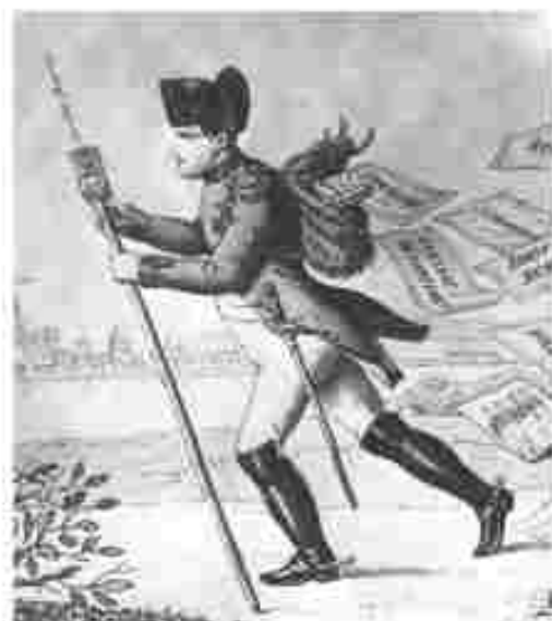
Fig. 5 — The courier of Rhineland loses all that he has on his way home from Leipzig. Napoleon here is represented as a postman on his way back to France after he lost the battle of Leipzig in 1813. Each letter dropping out of his bag bears the names of the territories he lost.

However, in the areas conquered, the reactions of the local populations to French rule were mixed. Initially, in many places such as Holland and Switzerland, as well as in certain cities like Brussels, Mainz, Milan and Warsaw, the French armies were welcomed as harbingers of liberty. But the initial enthusiasm soon turned to hostility, as it became clear that the new administrative arrangements did not go hand in hand with political freedom. Increased taxation, censorship, forced conscription into the French armies required to conquer the rest of Europe, all seemed to outweigh the advantages of the administrative changes.