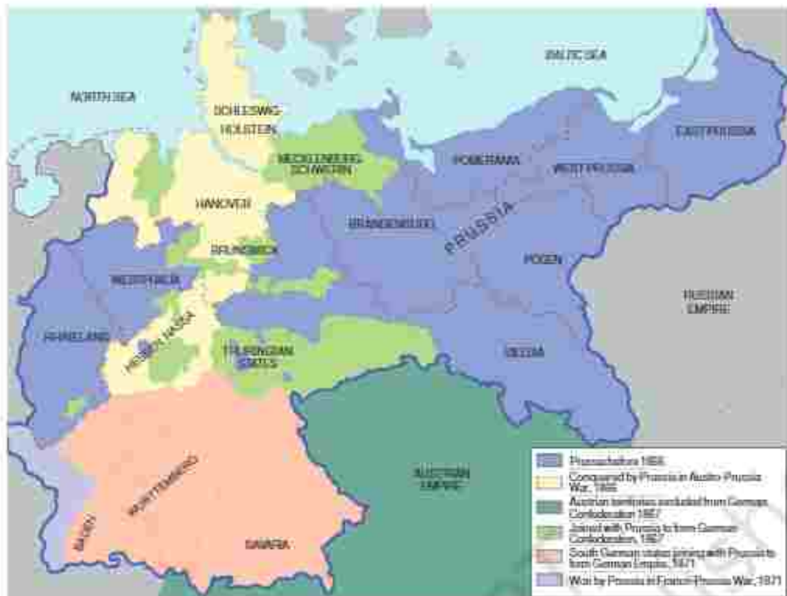
Fig. 12 – Unification of Germany (1866-71).