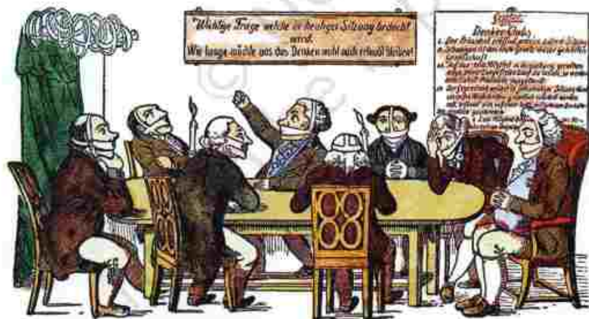
Fig. 6 – The Club of Thinkers , anonymous caricature dating to c. 1820.

What is the caricaturist trying to depict?