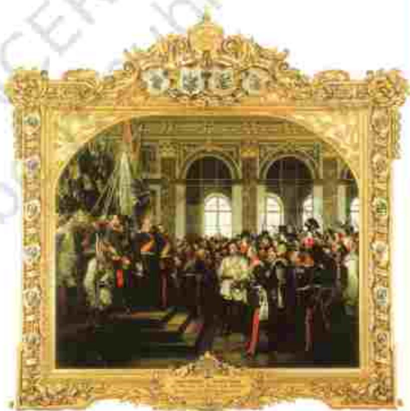
Fig. 11 – The proclamation of the German empire in the Hall of Mirrors at Versailles, Anton von Werner. At the centre stands the Kaiser and the chief commander of the Prussian army, General von Roon. Near them is Bismarck. This monumental work (2.7m x 2.7m) was completed and presented by the artist to Bismarck on the latter's 70th birthday in 1895.

The nation-building process in Germany had demonstrated the dominance of Prussian state power. The new state placed a strong emphasis on modernising the currency, banking, legal and judicial systems in Germany. Prussian measures and practices often became a model for the rest of Germany.