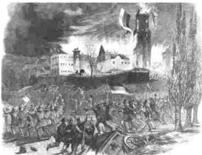
Fig. 9 – Peasants' uprising, 1848.

National Assembly proclaimed a Republic, granted suffrage to all adult males above 21, and guaranteed the right to work. National workshops to provide employment were set up.