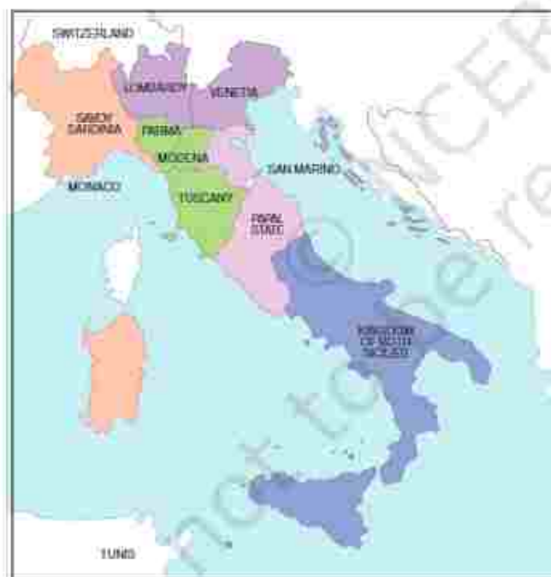
Fig. 14(a) — Italian states before unification, 1858.

Examine Fig. 14(b). Which was the first region to become a part of unified Italy? Which was the last region to join? In which year did the largest number of states join?