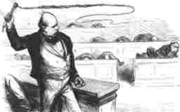
Fig. 13 – Caricature of Otto von Bismarck in the German reichstag (parliament), from Figaro, Vienna, 5 March 1870.

During the 1830s, Giuseppe Mazzini had sought to put together a coherent programme for a unitary Italian Republic. He had also formed a secret society called Young Italy for the dissemination of his goals. The failure of revolutionary uprisings both in 1831 and 1848 meant that the mantle now fell on Sardinia-Piedmont under its ruler King Victor Emmanuel II to unify the Italian states through war. In the eyes of the ruling elites of this region, a unified Italy offered them the possibility of economic development and political dominance.