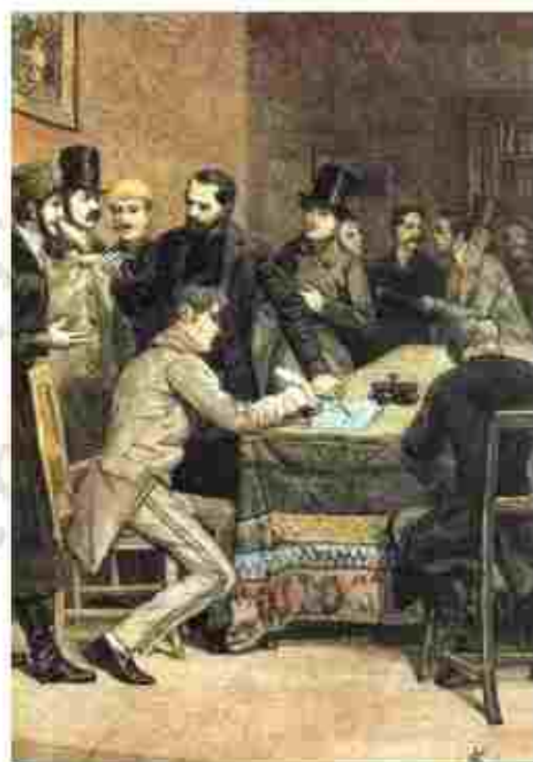
Fig. 7 – Giuseppe Mazzini and the founding of Young Europe in Berne 1833. Print by Giacomo Mantegazza.

One such individual was the Italian revolutionary Giuseppe Mazzini. Born in Genoa in 1805, he became a member of the secret society of the Carbonari. As a young man of 24, he was sent into exile in 1831 for attempting a revolution in Liguria. He subsequently founded two more underground societies, first, Young Italy in Marseille, and then, Young Europe in Berne, whose members were like-minded young men from Poland, France, Italy and the German states. Mazzini believed that God had intended nations to be the natural units of mankind. So Italy could not continue to be a patchwork of small states and kingdoms. It had to be forged into a single unified republic within a wider alliance of nations. This unification alone could be the basis of Italian liberty. Following his model, secret societies were set up in Germany, France, Switzerland and Poland. Mazzini's relentless opposition to monarchy and his vision of democratic republics frightened the conservatives. Metternich described him as 'the most dangerous enemy of our social order'.